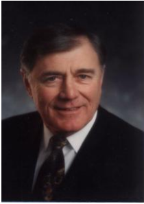
Raymond Frenette, Premier New Brunswick