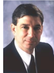
Pat Binns, Premier Prince Edward Island

The Council of Maritime Premiers has been one of the main advocates for cooperation in the Maritime provinces. Over the years, the Council has identified potential areas for cooperation and established mechanisms to move the cooperation agenda forward.