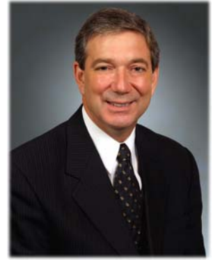
Bernard Lord, Premier New Brunswick